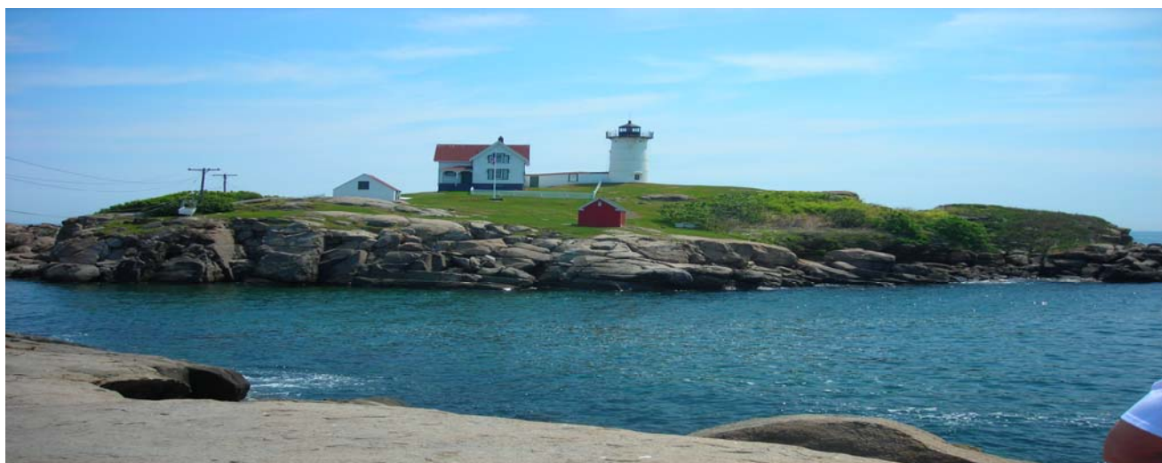
Nubble Lighthouse, York Beach, ME - Participants on Rick Merritt and Jack Schempp's Hampton Beach Bicycling Weekend rode 65 miles round trip from Hampton Beach, NH to Nubble Lighthouse in York Beach, ME. Spectacular weather was enjoyed all weekend.