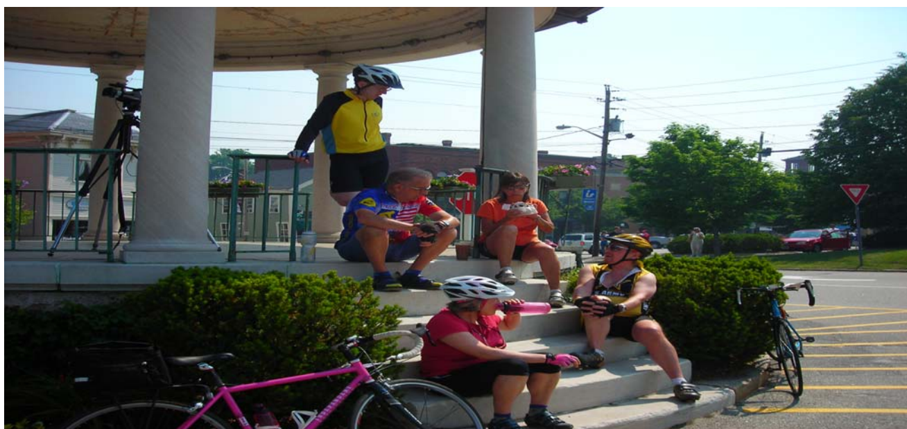
Town Gazebo, Exeter, NH - After a southern ride to Newburyport, MA , the Memorial Day holiday weekend culminated with an inland ride to Exeter, NH to see the parade from the vantage point of the town's gazebo.